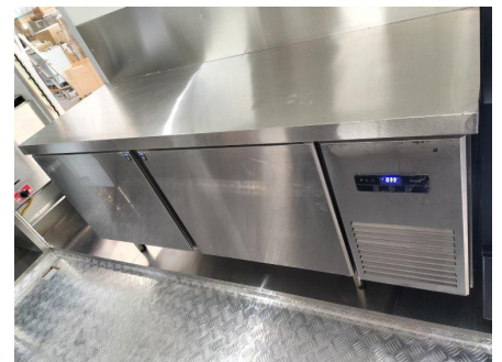
- Fridge -