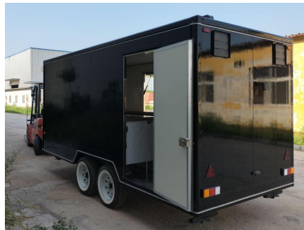
- Door -