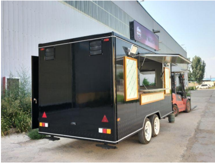
- Side -