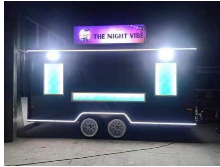
- Front -