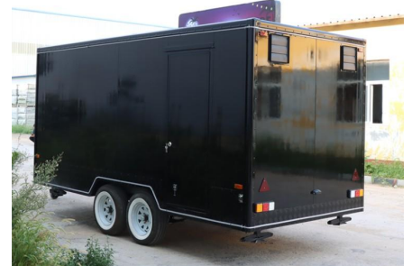
- Window -