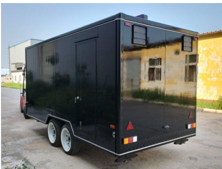
- Rear -