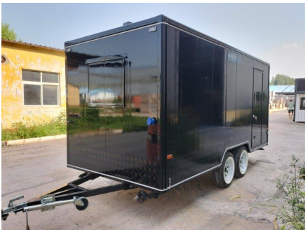
- Side -