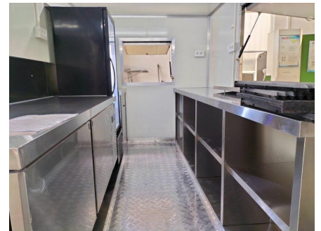
- Interior -