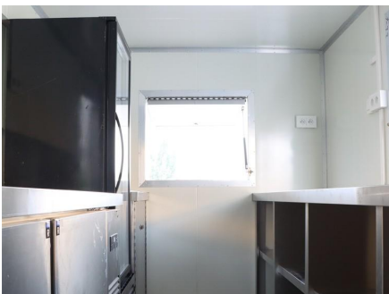
- Interior -