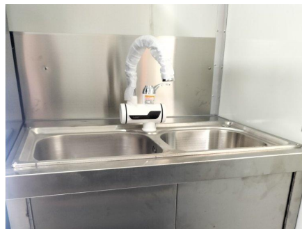
- Water Sink -