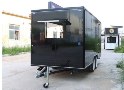
- Side -