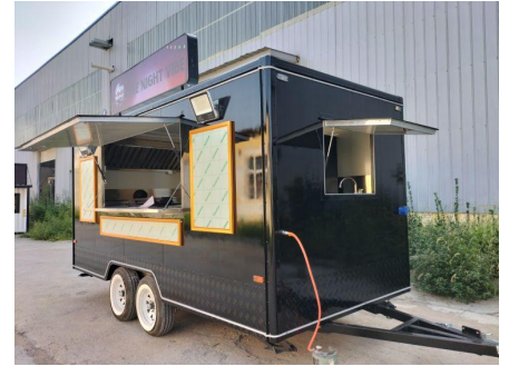
- Side -